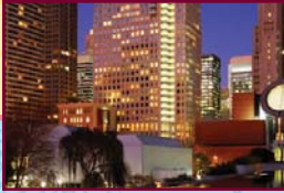
ST. REGIS HOTEL

ABOUT THE COVER: "Crossing the Pacific" – A China Trade or American folk-art reverse painting on glass depicting the Great Republic, a wooden side-wheeler operated by San Francisco's Pacific Mail Steamship Company, on the first regular trans-Pacific steamer service in 1867. Not only did trade and investment with Asia take off, but the pioneering route paved the way for Chinese and Japanese immigration, which has vastly enriched our economy and our culture.